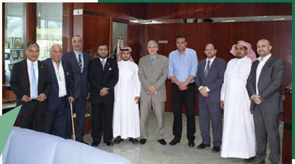
SKM Directors with the Guests