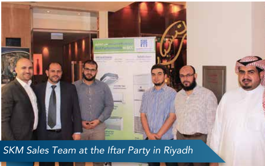
SKM Sales Team at the Iftar Party in Riyadh