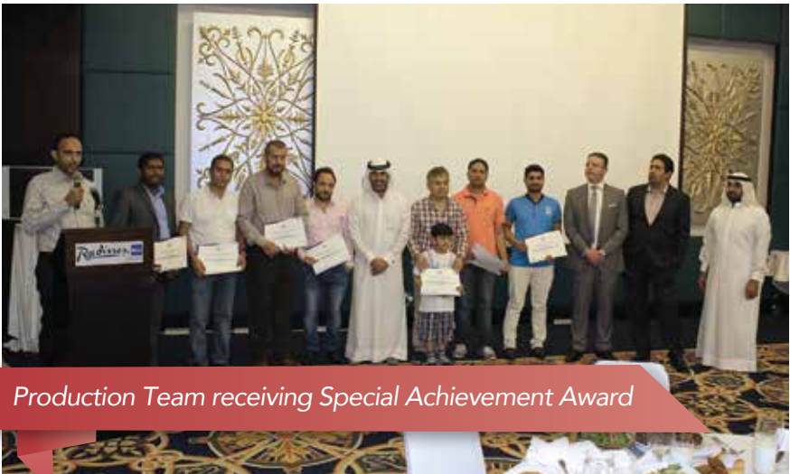
Production Team receiving Special Achievement Award