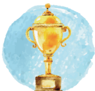
Table Tennis - Singles

SKM held its annual sports tournament from March 28 th to April 10 th 2016 at SKM recreation hall. It was arranged for tennis and billiards. Congratulations to all the winners: