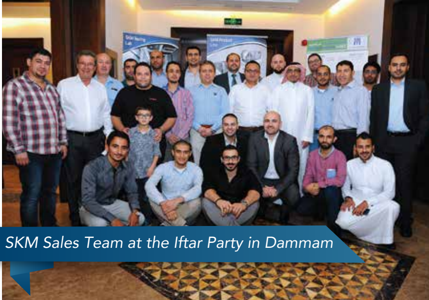
SKM Sales Team at the Iftar Party in Dammam

To celebrate the spirit of Ramadan, SKM held Iftar party for the clients in Riyadh and Dammam on 21st and 22nd June 2016 respectively. (It was attended by leading consultants, contractors and end users.